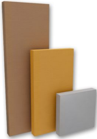
Image of 180x60cm, 120x60cm and 60x60cm models Ref.:MEL180, MEL120 and MEL060 (on the left) and Ref.:MEL120 models applied (ambient image).