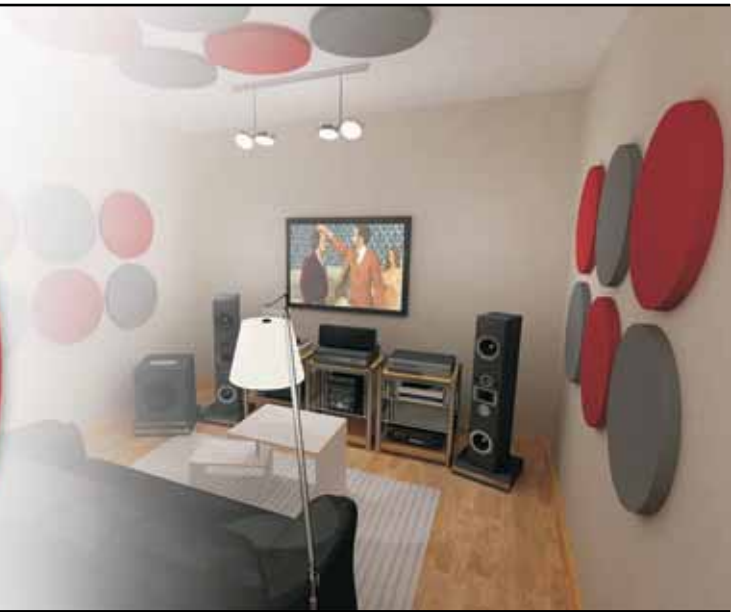
Image of 60x60cm pair models Ref.:COK060 (on the left) and the same applied (ambient image).