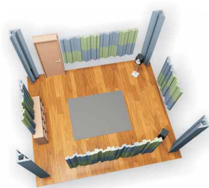
EXCELLENCE Sabine: 0.53 sec