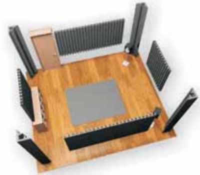
STANDARD Sabine: 0.53 sec