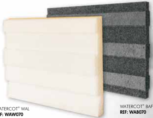
WATERCOT® WAL REF: WAW070