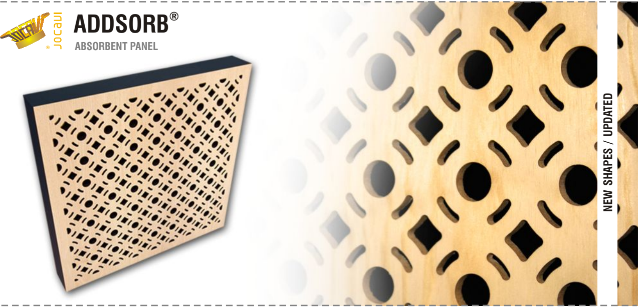
Image of 60x60cm model Ref.:ADDC060 (on the left) and Ref.:ADDC060 (ambient image).

This panel is mainly used for application in auditoriums, conference rooms, multipurpose rooms, places where acoustic treatment with a continuous coating surface is required. It is an absorbent panel that provides a relevant balance in the mid-range of the sound spectrum and also combines features of a unidirectional diffuser.